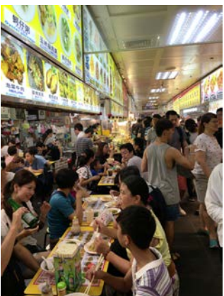
<math>\pm 林 night market