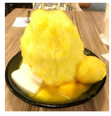
Ice-Monster also popular in Japan