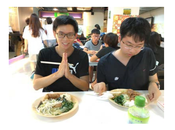
School cafeteria with Homing