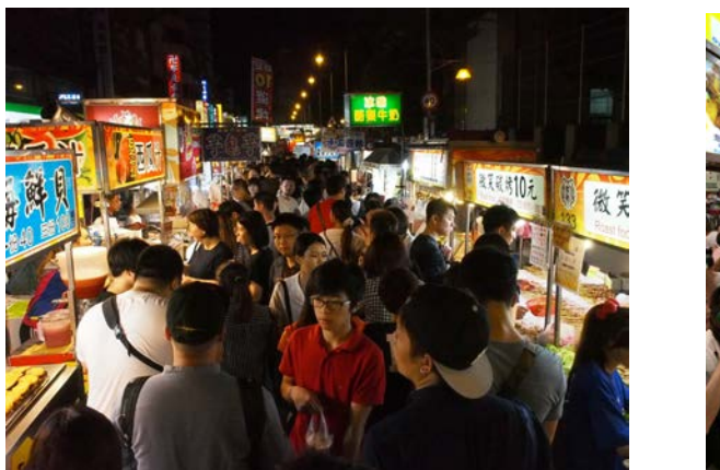
寧夏 night market