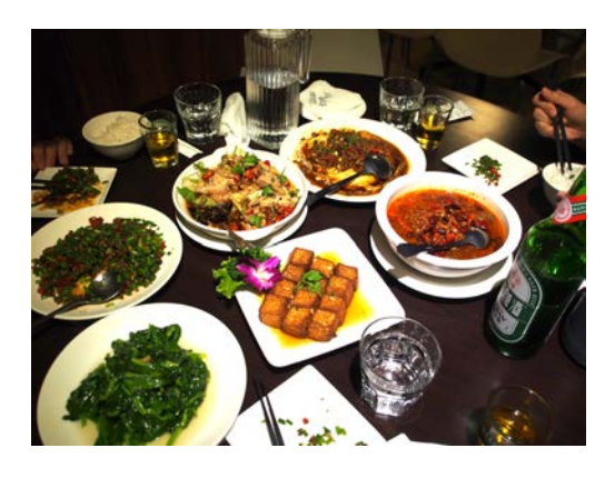
Spicy foods at 川妹子